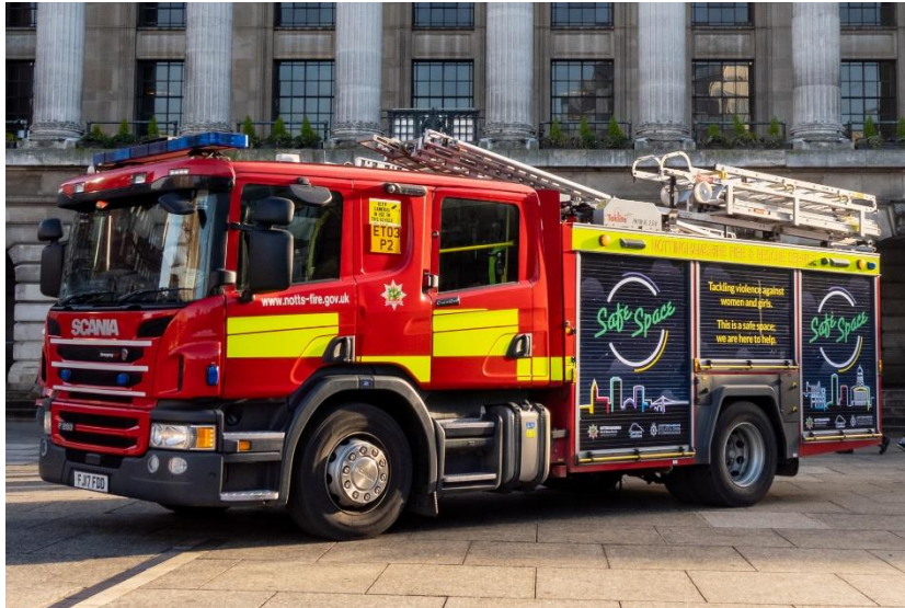
Image showing London Road fire appliance with the 'Safer Streets' wrapping.